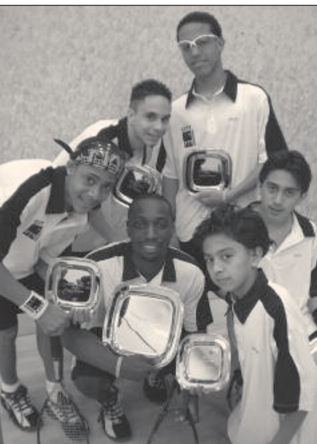
CitySquash's U15 Boys Team won the Urban National title at the SquashBusters Youth Center in Boston.